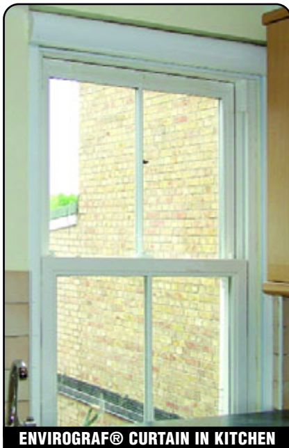
ENVIROGRAF® CURTAIN IN KITCHEN