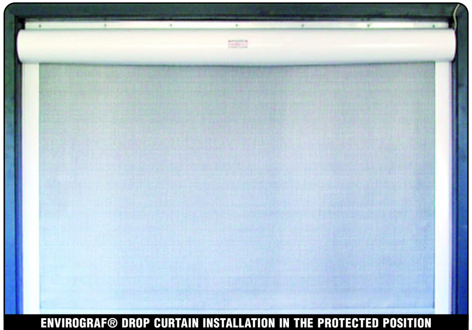
ENVIROGRAF® DROP CURTAIN INSTALLATION IN THE PROTECTED POSITION