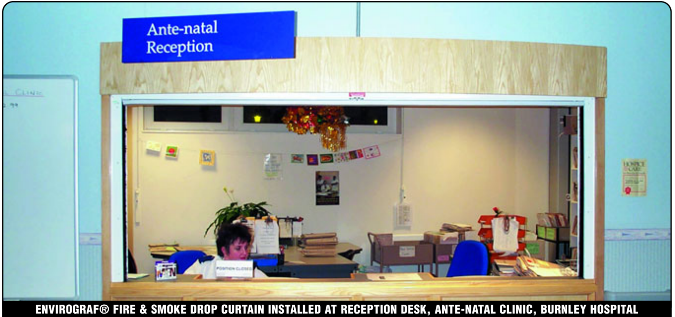
ENVIROGRAF® FIRE & SMOKE DROP CURTAIN INSTALLED AT RECEPTION DESK, ANTE-NATAL CLINIC, BURNLEY HOSPITAL